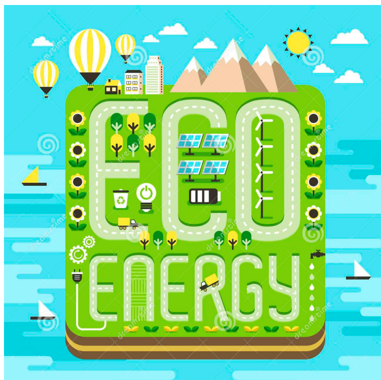
Fig. 2. Example of visualised summarisation of ecoenergy issues [10]

Consequently, an apparent task in public education is to integrate RES-related knowledge into elementary school curriculum and intensify this knowledge in secondary schools. The objectives set for the above can have a broad range including training for practicality and introduction of environmentally friendly and cost-effective technologies etc. However, it is important to note that graduating students should be aware of the essentials and main advantages of these innovations, by which a considerable contribution to the energy-conscious development of society can be made.