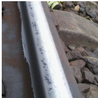
Fig. 3. Outer rail of curve No. 1 with side wear

In order to determine the reasons for intensive wear of the rails at curve No. 1, their condition was analyzed from January 2014 to 1 October 2015. The side wear of the rails at this curve during the period of observation reached 16 mm (Figure 3) forming a shelf (which is characteristic of rails with more than 10 mm side wear).