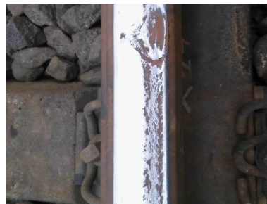
Fig. 4. Inner rail with defect on the surface of the head

On the surface of the head of the inner rail, peeling and spalling of metal is observed (Figure 4).