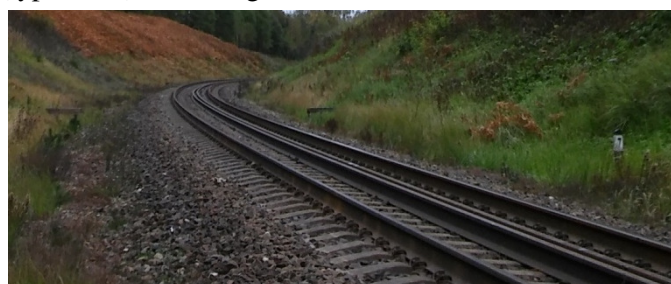
Fig. 2. Curve No. 1 on the line Sece-Sēlpils 274.5885 km to 275.2570 km; R = 640 \text{ m} ; outer rail elevation h = 90 \text{ mm}

The condition of the rails at curve No. 1 was examined (Figure 1, Figure 2). The curve in the direction from Krustpils is located on an elevation with the downgrade from 3.5 ‰ up to 6.8 ‰ (other small radius curves – on an inclination). The traffic in gross weight comprises more than 25 million tons a year; according to the norms of the Latvian railway, the maximum side wear for the rails installed at this curve (type R-65) with the given load is 15 mm.