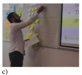
Fig. 2. Brainstorming session: a – initial discussion; b – group discussion; c – presentation of group's results

The second task was to create and define the vision of rural attractiveness. Then the definition of rural attractiveness was tested from the perspective of hypothetical stakeholders (imaginary persons). The main questions to address were: is the definition complete? What is missing? What, if anything, could be added? The results provided by all groups formed the basis for the survey's questionnaire creation.