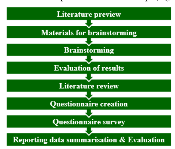
Fig. 1. Steps of rural attractiveness initial vision's development

The role of vision in sustainability research and problem solving has been recognized in academic and policy research, and visioning has been widely integrated in comprehensive procedural frameworks leading from problem definition to strategy implementation [10]. In PoliRural, the development of an initial definition of rural attractiveness, as well as the identification of assets, needs challenges, opportunities and enablers was performed in several steps (Fig. 1).