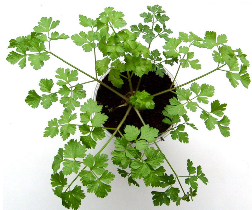
Fig. 1. Rosette of parsley leaves