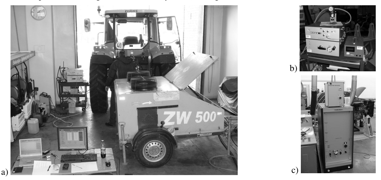
Fig. 1. Test object and measuring equipment: a – CLAAS ARES 557ATX and MAHA ZW-500; b – AVL KMA MOBILE; c – AVL SESAM FTIR

The tractor power was determined from the power take-off (PTO) using dynamometer MAHA ZW-500 (See Fig. 1a). Simultaneously the hourly fuel consumption and exhaust emissions were measured, accordingly using AVL KMA MOBILE fuel consumption meter and AVL SESAM FTIR multi-component exhaust gas measurement system (See Fig. 1b and 1c).